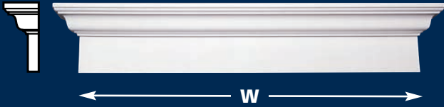
9" x 4 1/2" Projection Window And Door Crossheads

Custom width available at 1/2" increments