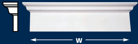
12" x 4 1/2" Projection Window And Door Crossheads

For any size over 144" call for availability